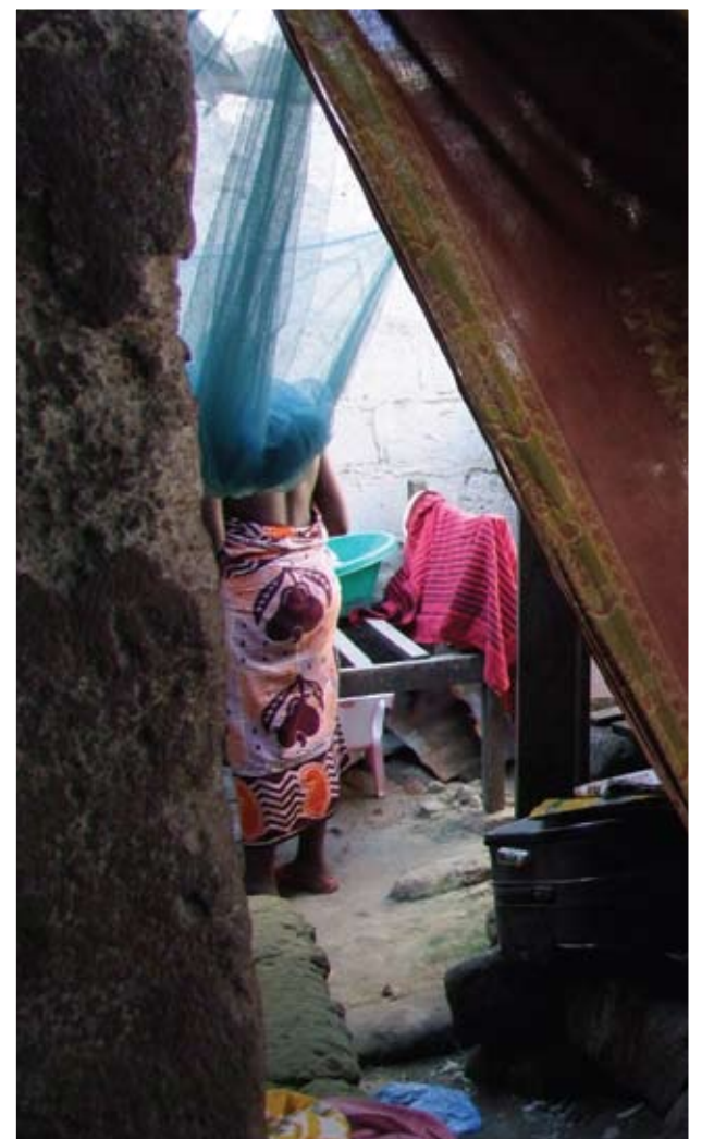
BOTTOM A peek into the kitchen of a family home in Dar es Salaam.