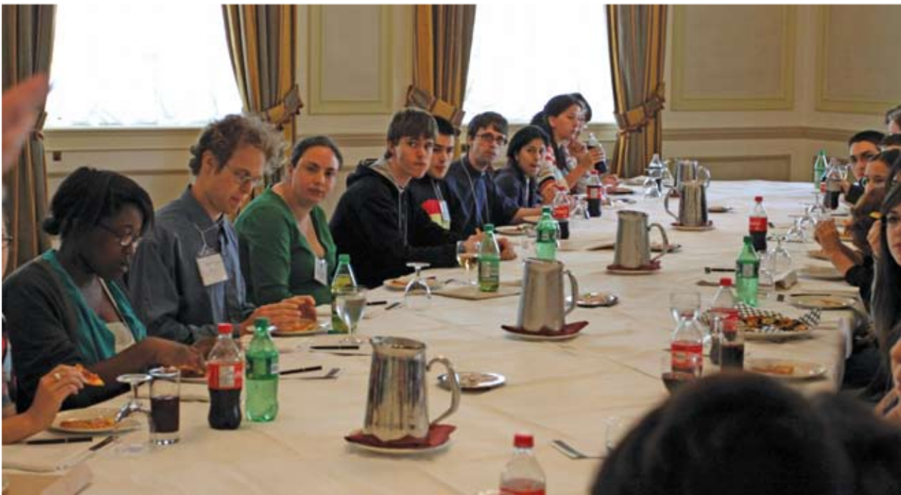
Having fun at Synod eating pizza with the Bishop (TOP) and sleeping over with friends (BOTTOM).

A copy of Beyond the Gods & Back is available as part of the Diocese's youth resources. If you'd like to read it, get in touch with Phil at Synod Office. ✦