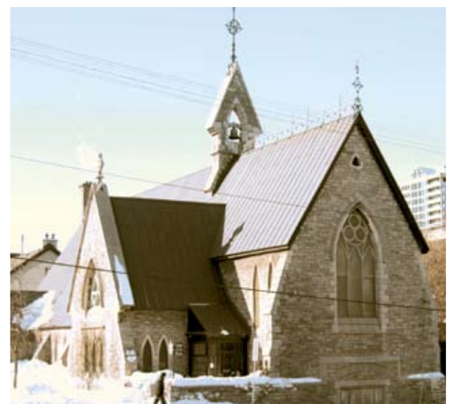
St. Alban's Church.

has said, no person should be asked to choose between their faith and their church. ✠