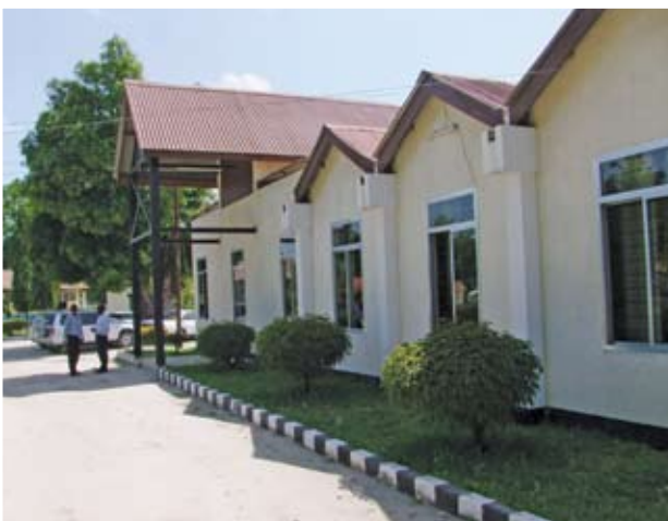
TOP St. Albans Cathedral, Dar es Salaam.