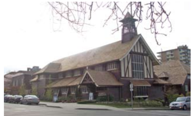
LEFT St. Mary's tent in Kerrisdale, 1911. RIGHT St. Mary's, Kerrisdale today.