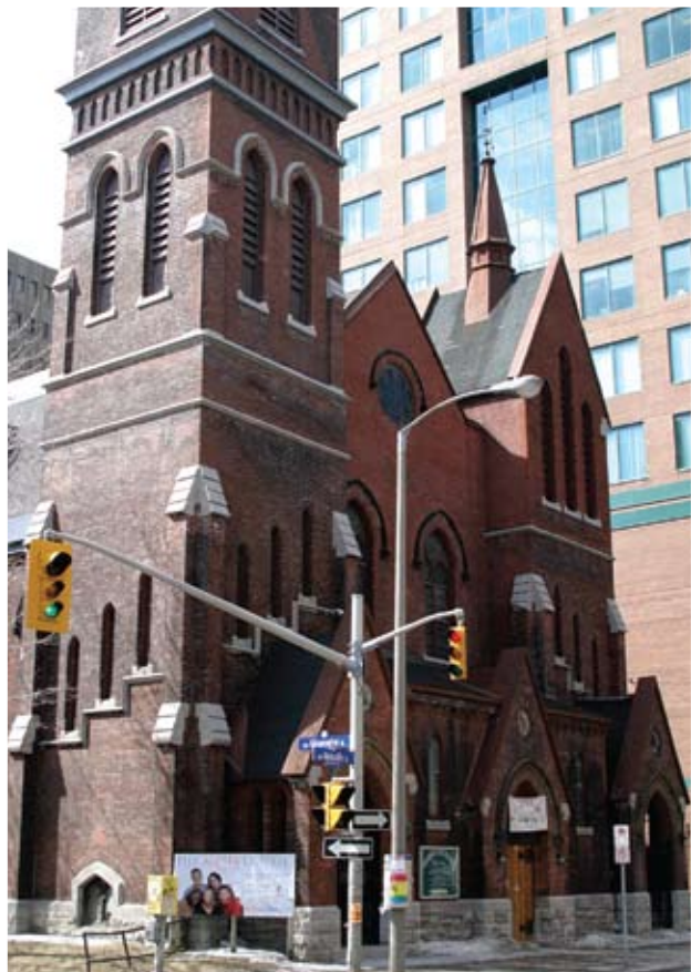
St. George's Church (courtesy of the Anglican Diocese of Ottawa Archives • OC06 E100). PHOTO Brian Glenn.