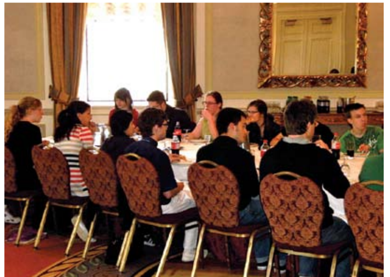
Youth lunch at Synod 2010.

to explain, this activity paralleled the discussions on the second day of Synod revolving around moving our church back into the neighbourhood. Often we have a great desire to share a piece of music or video clip which we discover as widely as possible. What if the same were true with our church? And with our own faith journeys? How would