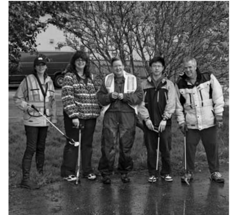
MORE Around the Diocese on PAGE 5