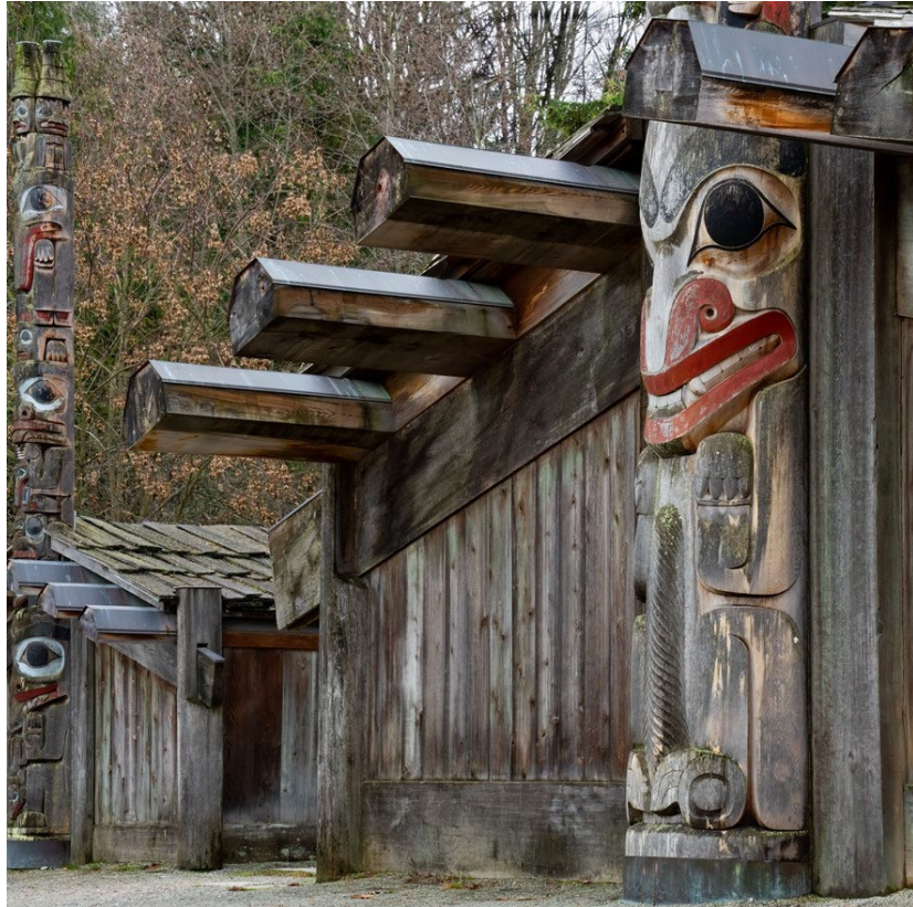
Longhouses and poles by Bill Reid and Jim Hart, UBC Museum of Anthropology.

To increase awareness and understanding of the issues and causes surrounding homelessness and housing vulnerability and to provide practical options for the Diocese and its parishes to use its gifts and resources to respond