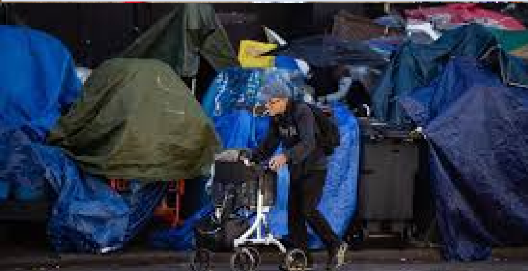
Responding to Tent Cities