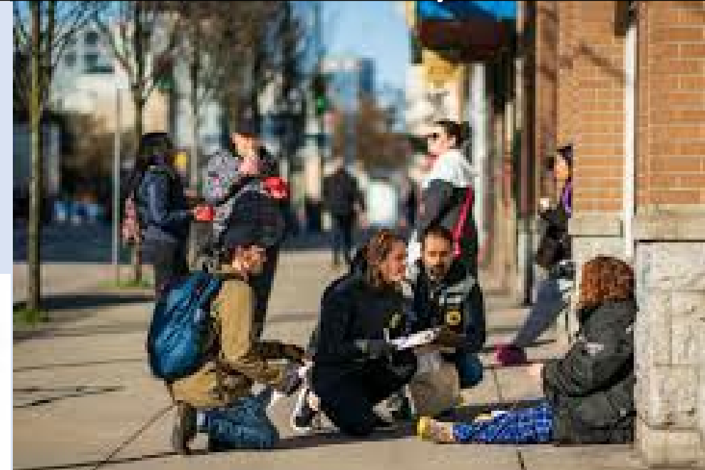
Annual Homeless Counts