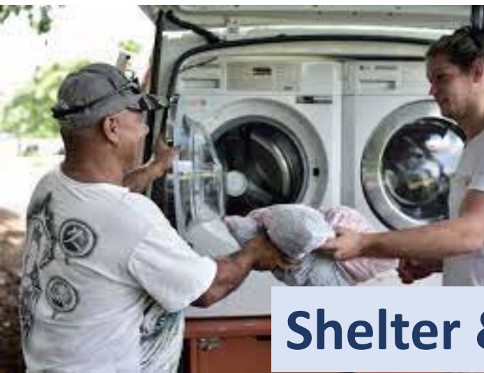
Shelter & Services