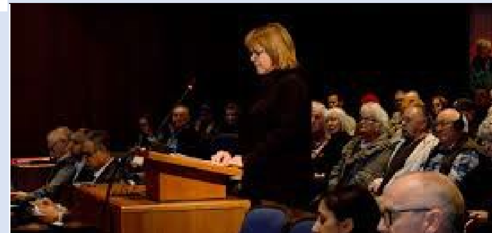
Influencing government policy