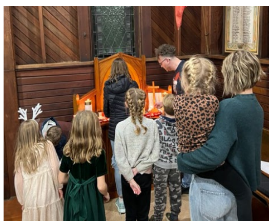
Candle lighting at Family Eucharist Service