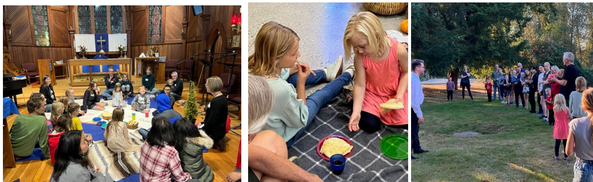
Family Service at St. Thomas Sharing communion & Get-to-know-you games at St. Andrew's

An exciting addition to the life of the Centre is the intentional Spiritual Formation for Children, Youth, and Families . Saturday afternoon Family Eucharist Services (4:30 – 6:30 pm) provide families with an opportunity to connect with other families, learn and practice Anglican liturgy and share together in a picnic Eucharist. We enjoy get-to-know-you games and formative and thought-provoking activities, with supper provided. We are seeing that people want a spiritual family and location to belong. Saturday evening family services have been an outreach for those wanting spiritual nourishment for their families and an invitation for some to return to church at a time that works well for lots of families.