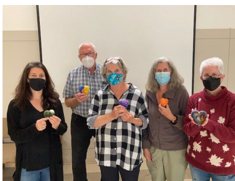
Felted hearts for Indigenous children