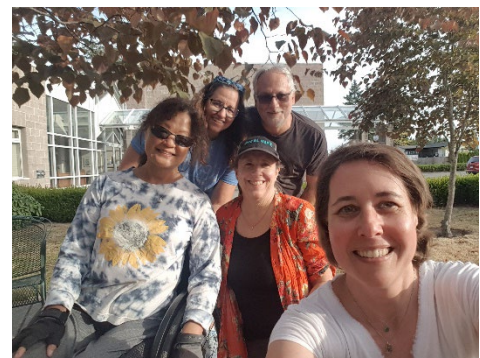
Setting out on a pilgrimage