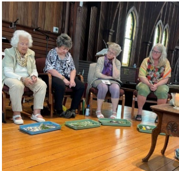
Building Nature Altars