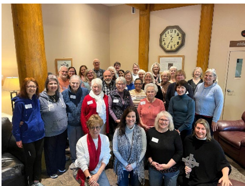
Loon Lake Retreat with ACW + others