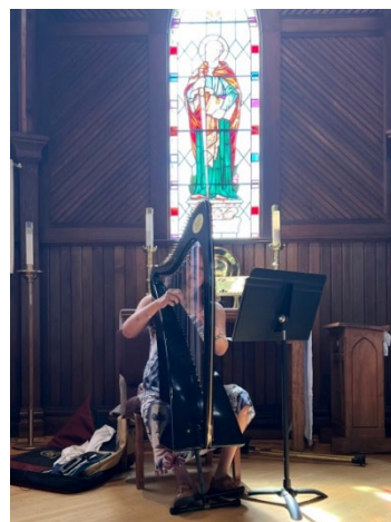
Contemplation with the harp