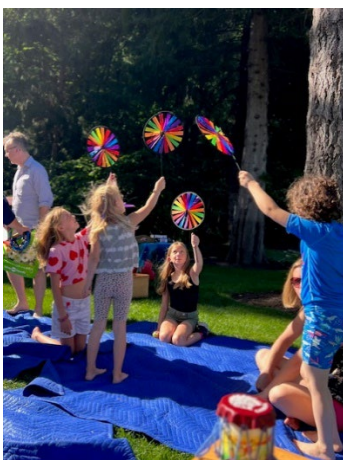
The Holy Spirit came in Wind