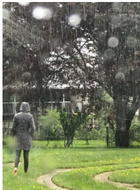
Rain or Shine!