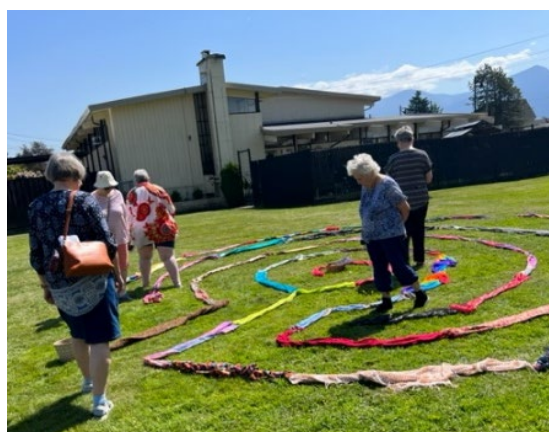
Walking a delightful scarf labyrinth!