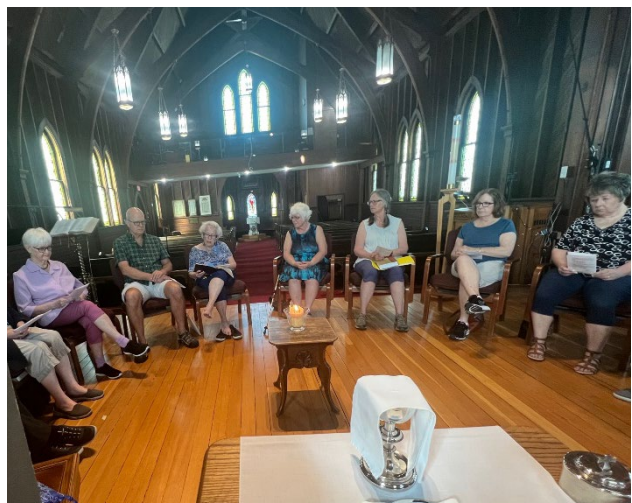
Circle of Grace Spiritual Practice at St. Thomas