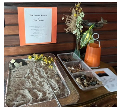
Seasonal Prayer Stations