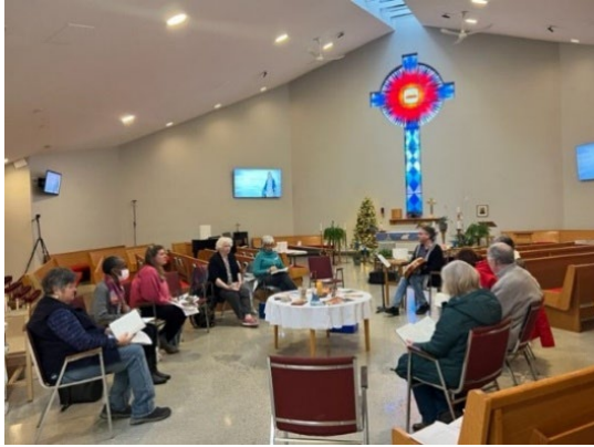
Advent & Lent retreats