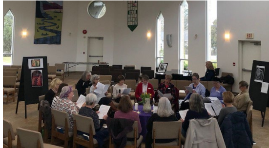
“The Women in the Easter Story” with Art