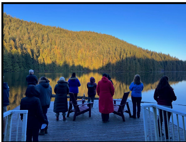
Celtic Spirituality Retreat at Loon Lake, Maple Ridge 2022

Each parish has its own particular areas of focus and style of doing spiritual formation. Having a Centre organizes, inspires, and ensures that Spiritual Development and Practices in a parish remain a top priority. Having a Centre also develops leadership in the parish with various ways people can use their gifts and talents in the church and invite others to join. Alleluia!