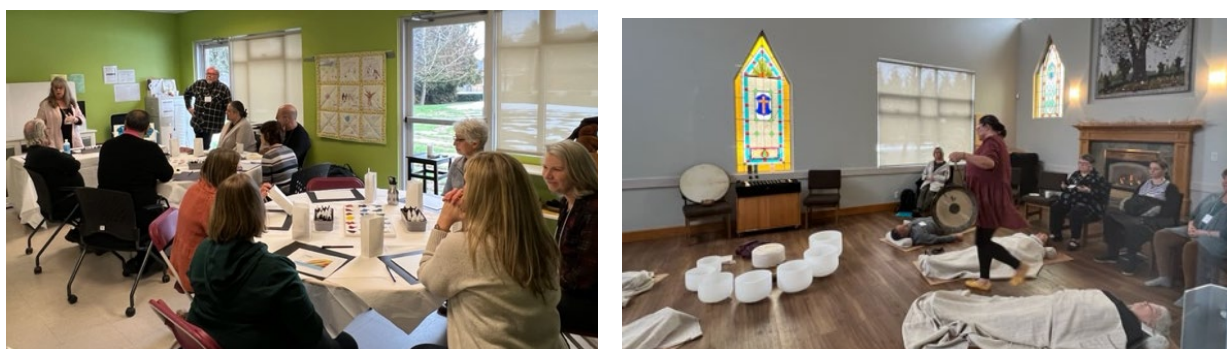
Key notes, workshops, Prayer Stations, One-on-one Spiritual Care Sessions...