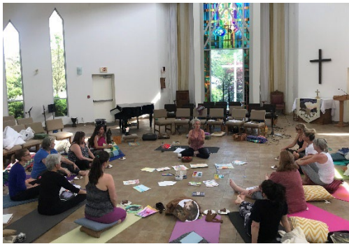
Yoga & soul work retreats