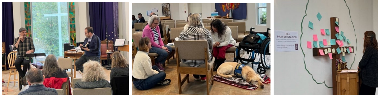
Ecumenical Retreat-Conference AWAKEN LOVE 2023