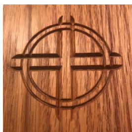
Centre Logo (old pews)