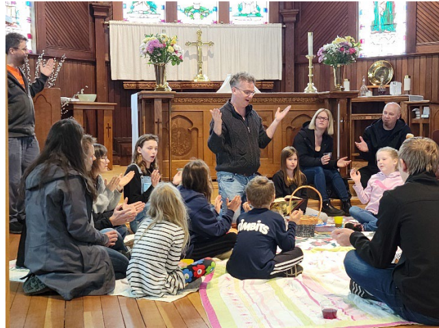
Picnic Eucharist – A highlight for all!