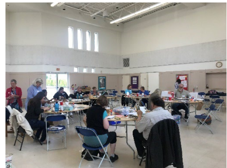
Creative Journaling workshops